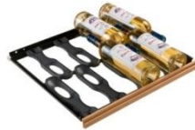
Sliding shelf ACMSC

— AXLNH 50 — ACMSC 8 — AXLNH 50 — AXLNH 50 — 6 164