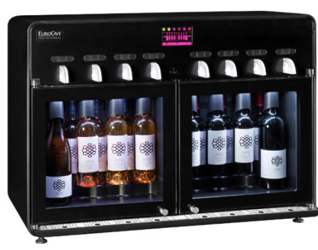
Non binding image